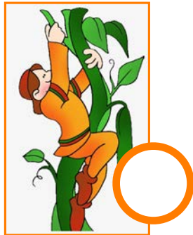
Jack and the Beanstalk