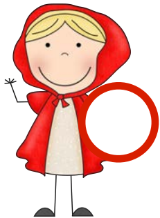
Little Red Riding Hood