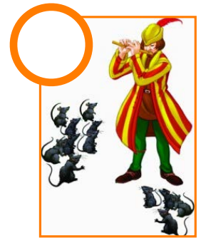
The Pied Piper