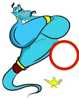
Genie of the Lamp